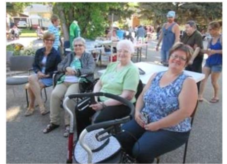
Shalom Family Picnic