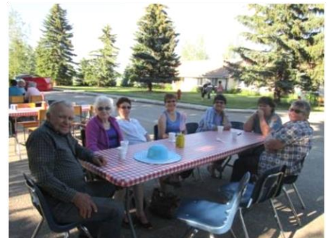
Shalom Family Picnic