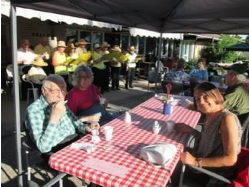
SHALOM FAMILY PICNIC