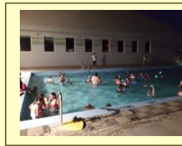
Cupar Pool – a treasure of the community

As this is quite an expensive venture, and the grant does not cover all the Reno's that need to be done, we are reaching out to the community to help out by raising enough money to replace the patio stones around the pool on the deck. We are selling 'Bricks' at a cost of $100/brick and everyone who buys one will have their name on a plaque displayed at the