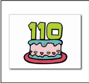
"Cupar is celebrating a Milestone Birthday on July 4th, 2015"